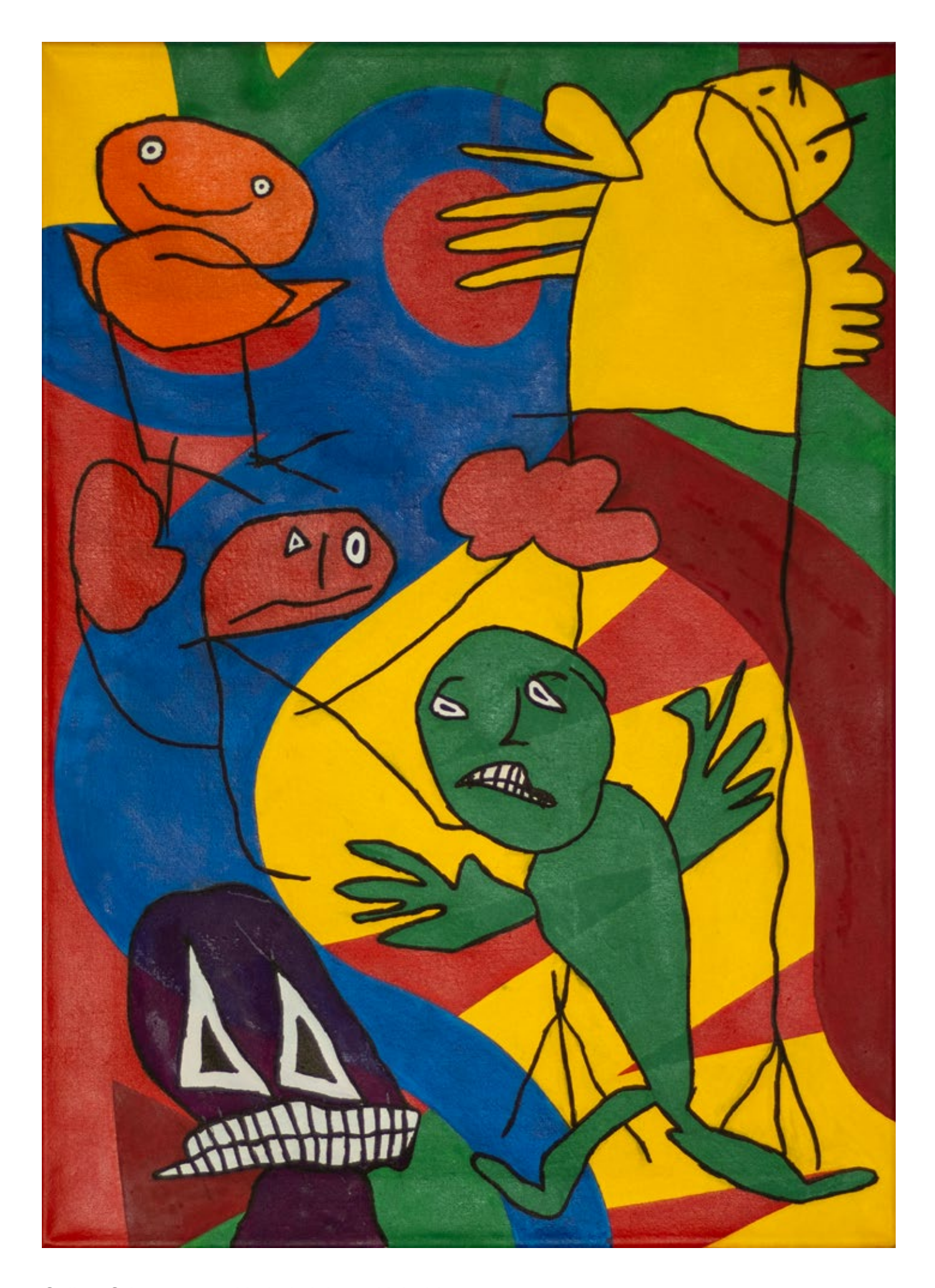
Gelber Griesgram und kobaltvioletter Kobold, 2025 Oil and acrylic marker on canvas 100 x 120 cm