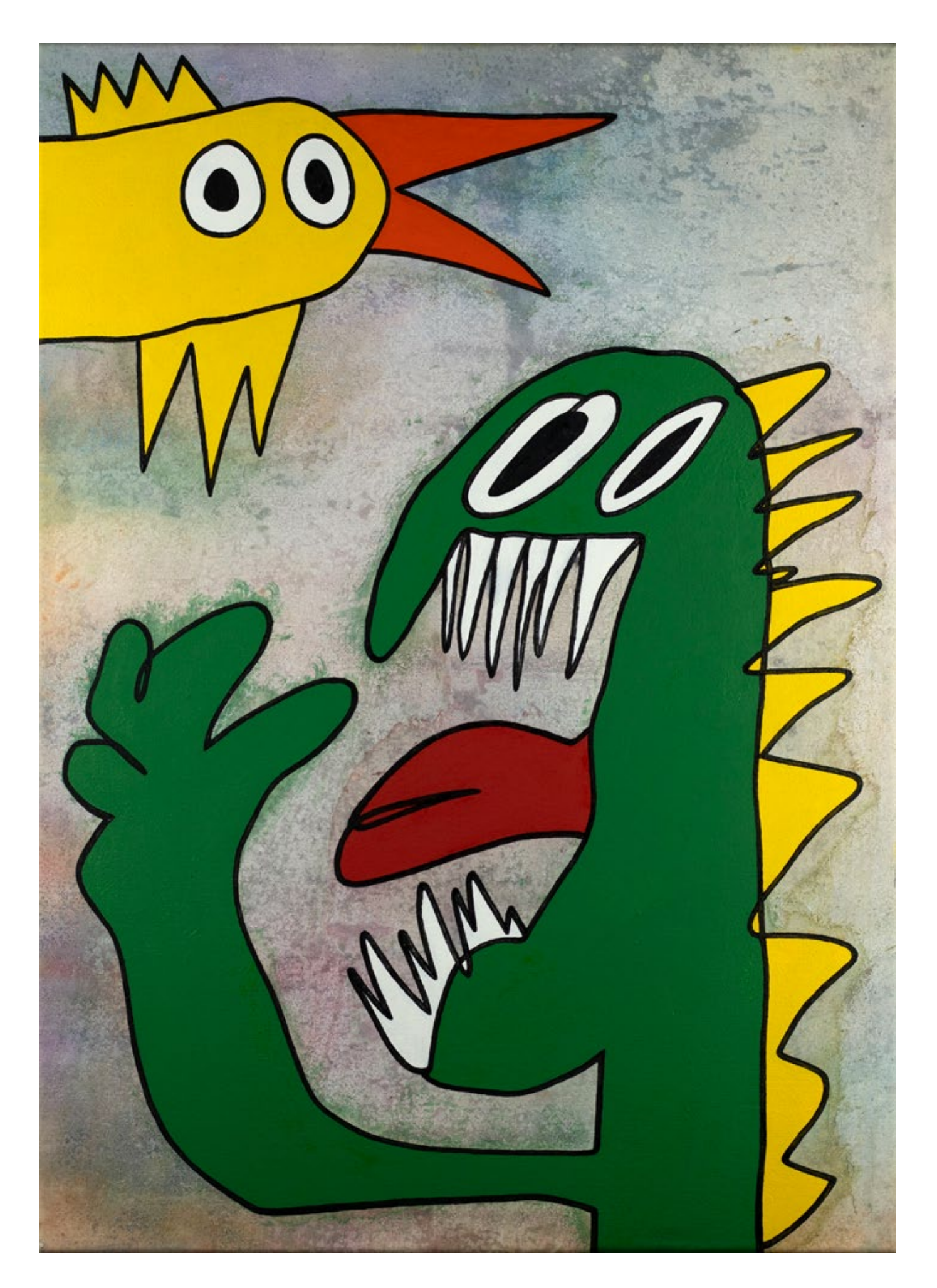
Ornitho-jurassische Grüsse, 2024 Mixed media on canvas 70 x 50 cm