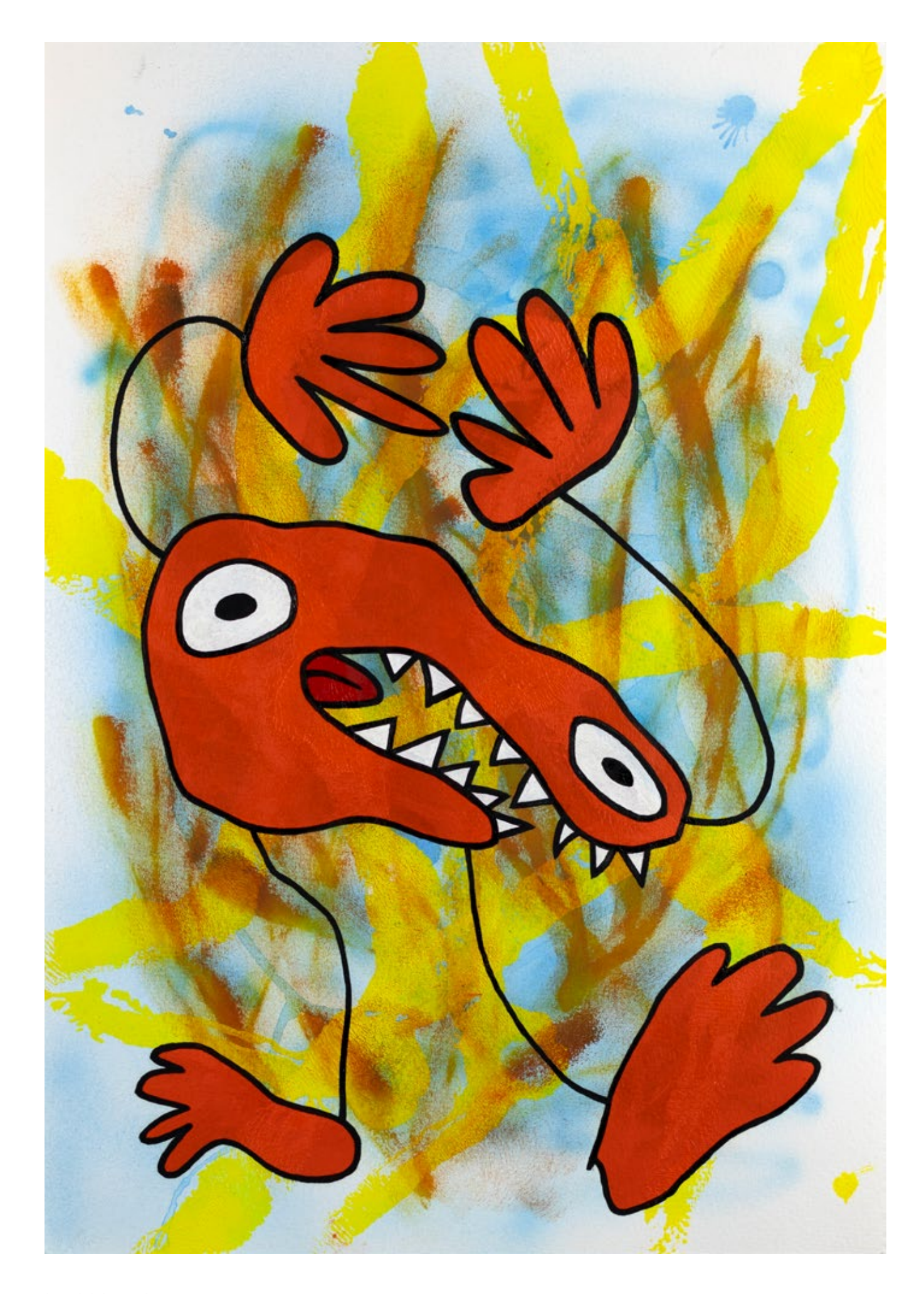
Laubbläserinferno, 2024 Oil and acrylic paint on paper 42 x 29,7 cm