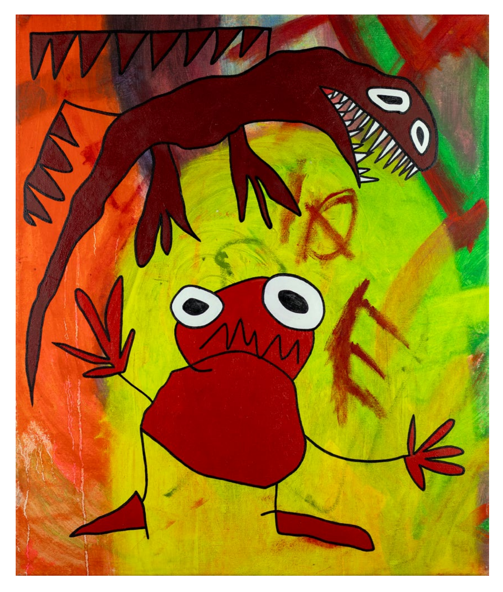
Chromatischer Drache und Yurp, 2024 Oil on canvas 70 x 60 cm