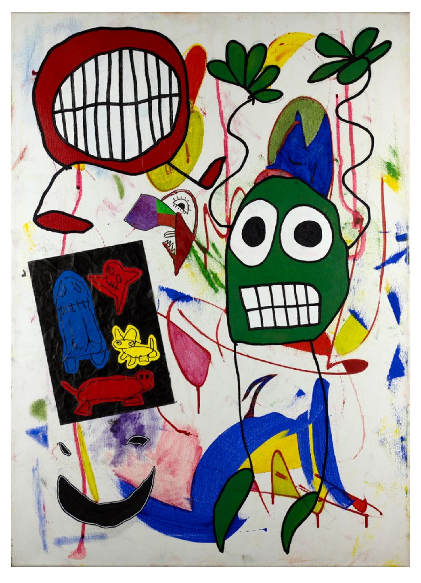
Rotverschiebung in Richtung Wut, 2024 Mixed media on canvas 70 x 50 cm