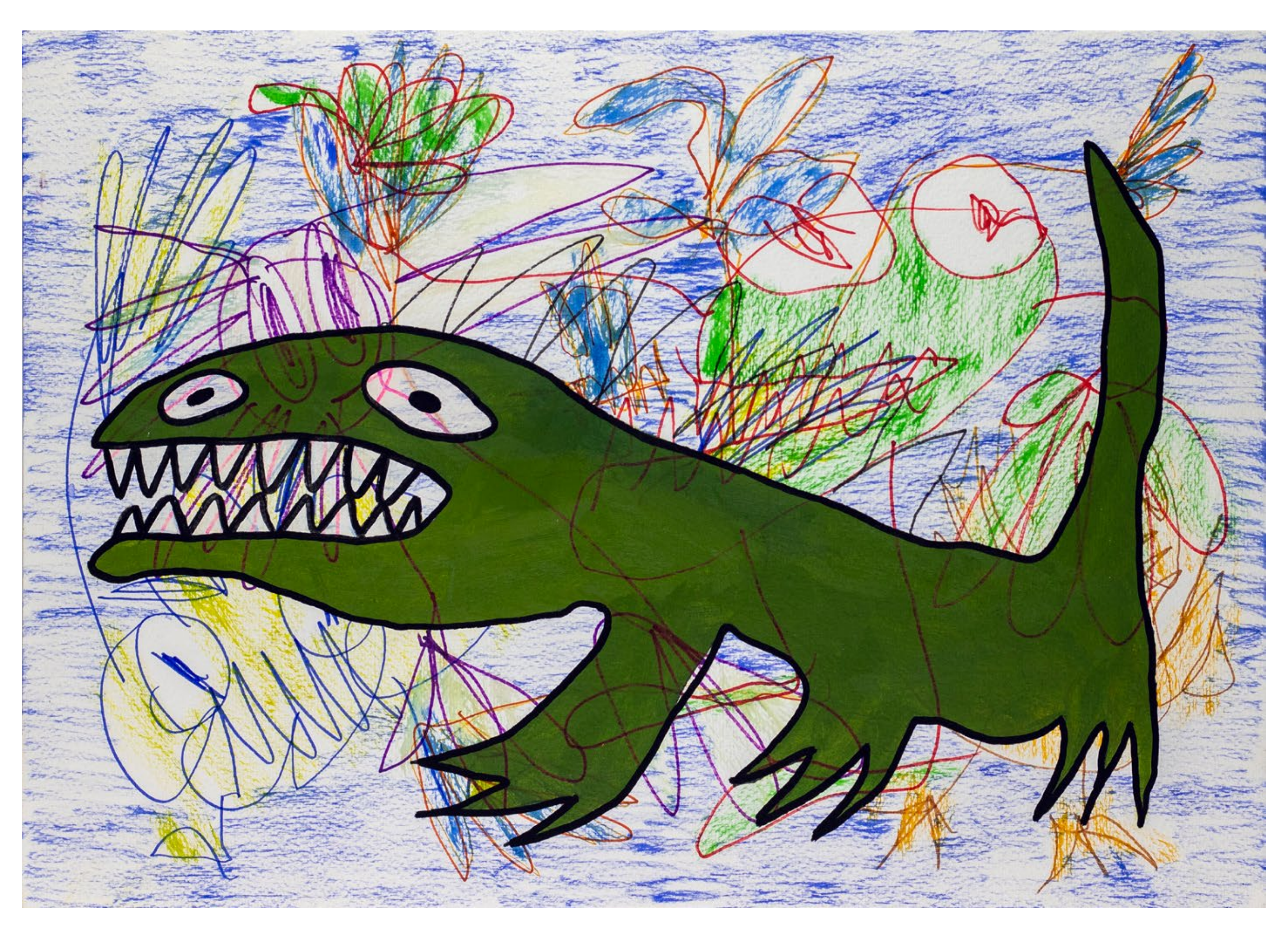
As a child I was forced to eat vegetables, 2024 Mixed media on paper 24 x 32 cm