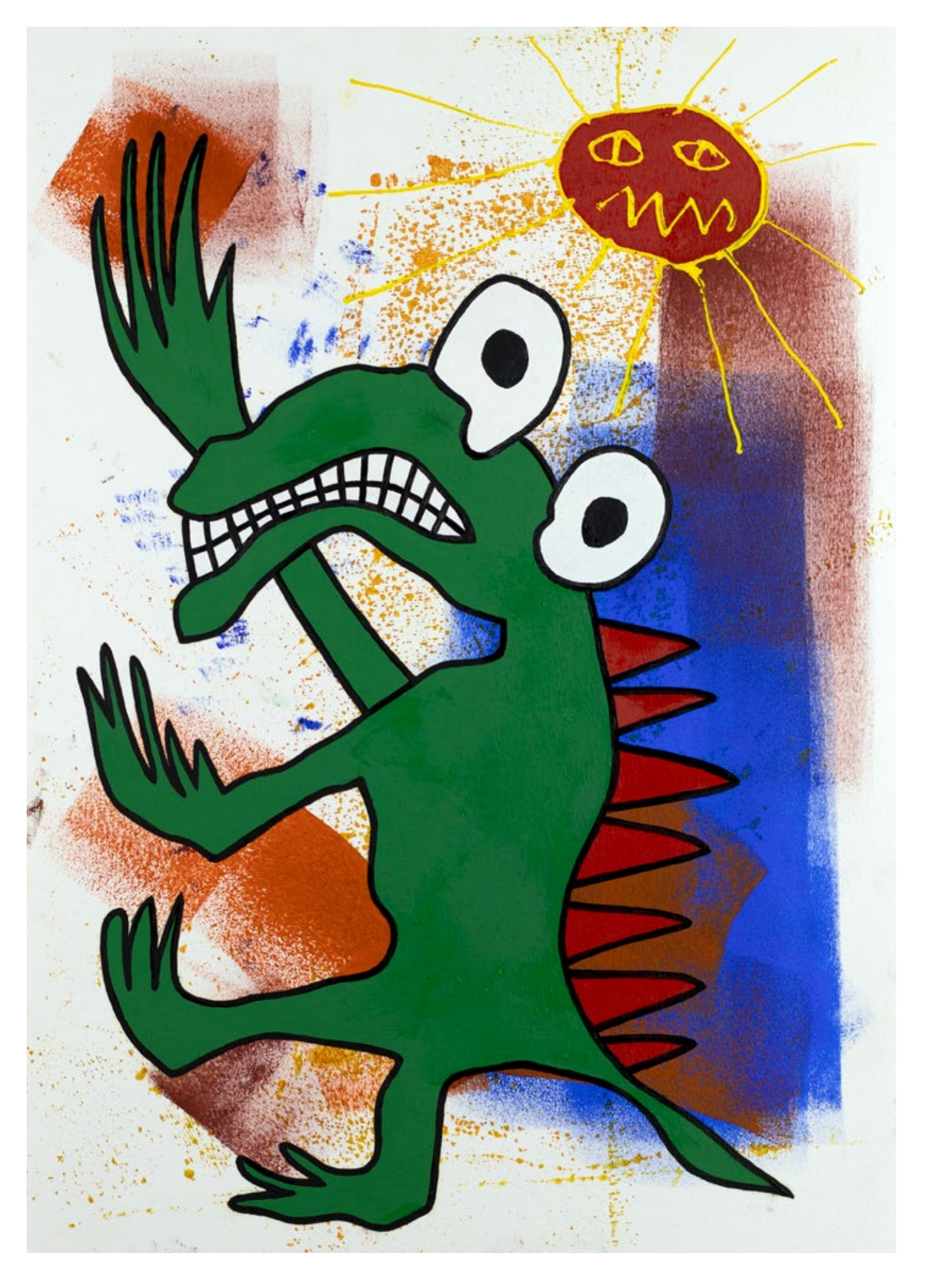
Awkwardly dancing through life, 2024 Oil and acrylic paint on paper 42 x 29,7 cm