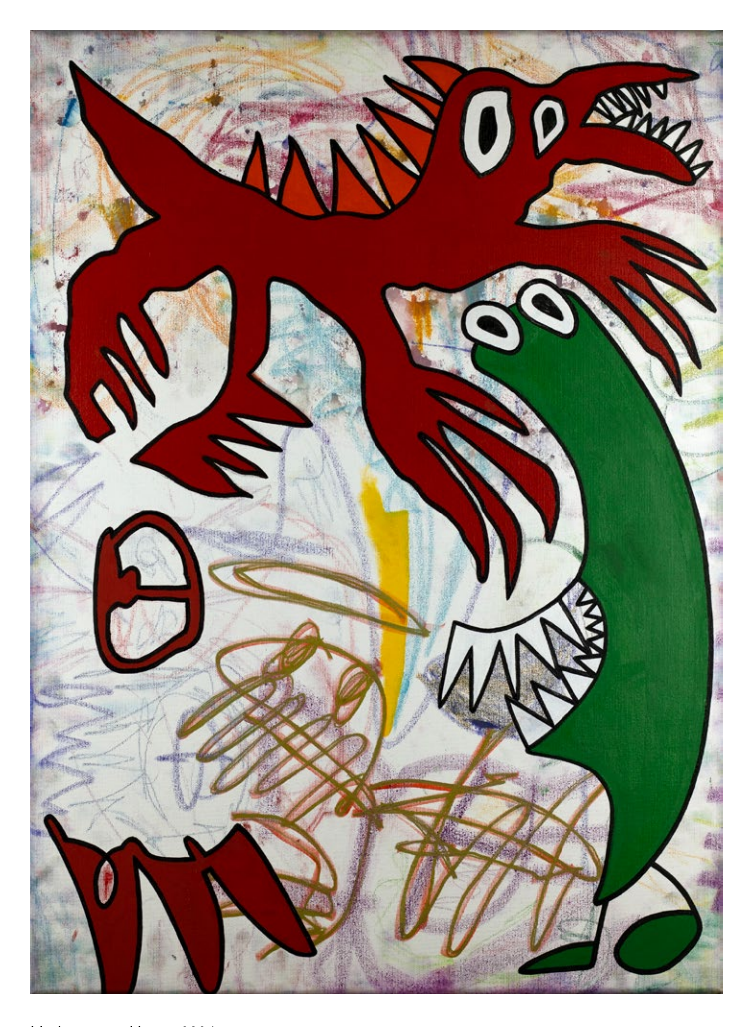
Lindwurm und Lenz, 2024 Mixed media on canvas 70 x 50 cm