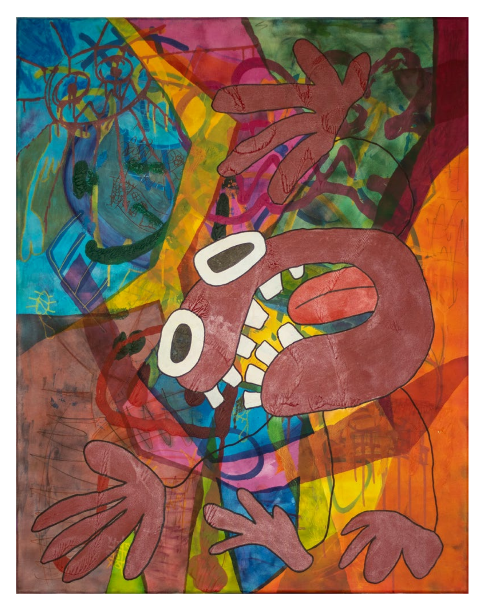
Chromatische Reizüberflutung, 2025 Mixed media on canvas 100 x 120 cm